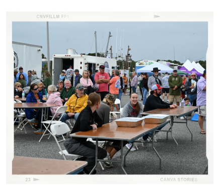
FOOD TRUCK VENDORS