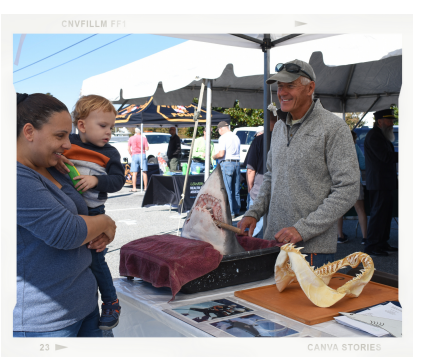
EDUCATION AND MARITIME HERITAGE