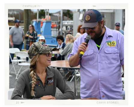
CRAB CAKE EATING CONTEST