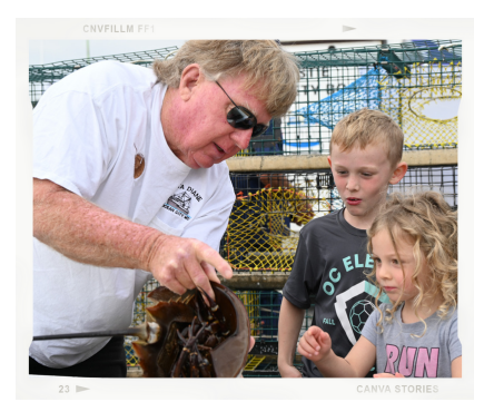
KIDS ACTIVITIES AND TOUCH TANK