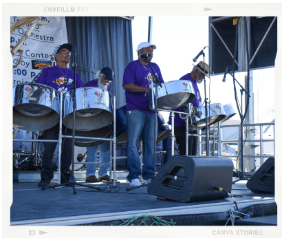
LIVE BAND PERFORMANCES