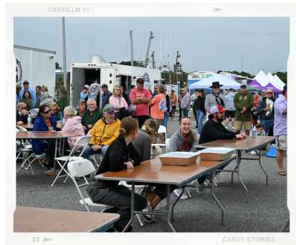
FOOD TRUCK VENDORS