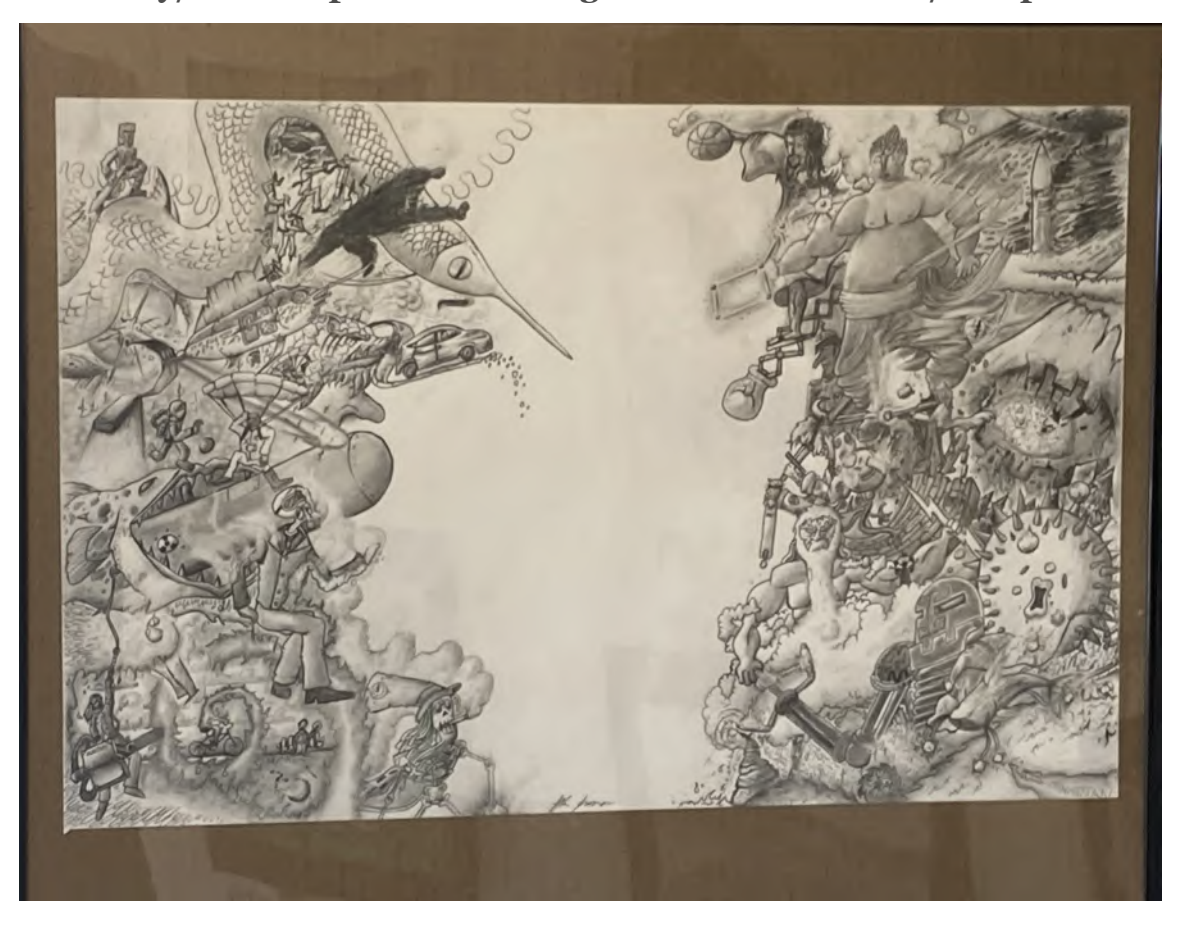
Blick Gift Certificate - Luke Laeser—"The Battle of Time"